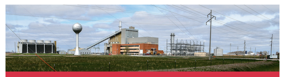
Above Corn Belt Power Cooperative's Wisdom Station Unit I and Unit II remain ready and capable of generating electric power during times of peak demand. Plants like Wisdom Station are crucial to America's electric supply.

ccording to the U.S. Department of Energy Information Administration, power grid operators are planning to retire 5.2 gigawatts of power generation capacity this year, which adds up to a 62 percent fall from last year, when 13.5 GW worth of capacity went offline. This is the biggest slowdown in power plant retirements since 2008, according to the EIA.